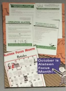
"Operation Alateen" was launched to improve Al-Anon's commitment to Alateens. Al-Anon groups were asked to send a new banner group to support an existing group. October was declared "Alateen Focus Month" for a three-year trial basis.