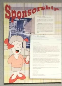
The 2002 World Service Conference passed Motion 88 endorsing Al-Anon for full responsibility for operating Alateen groups. On December 8, 2002, the Board of Directors passed the Alateen Motion that included Minimum Safety and Behavioral Requirements.