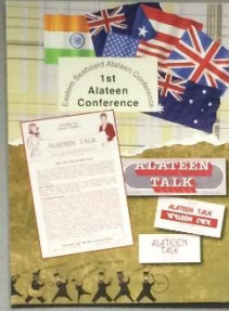
The first Alateen conference was held in College Park, Maryland. The number of groups registered. In response, the Alateen world held first joint of members and the Alateen Committee was formed at the World Service Office.