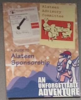
The Alateen Advisory Committee began a three-year trial period. The Committee identifies and articulates the needs of teenage members. A Guide to Alateen Sponsorship – An Unforgettable Adventure #148 This book is distributed to all the Sponsors. There should be one Alateen without their Sponsors available. For every group must have a Sponsor. Sponsor: A Guide to Alateen Sponsorship. An unforgettable adventure page 14