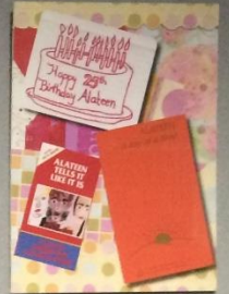
The members of the celebration of Alateen's 25th birthday. "Happy 25th Birthday Alateen" was a gift to Alateen from the members of the Alateen Committee.