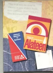
Alateen Speaks to Children of Alcoholics tells the story of Alateen. It tells of their lives, their problems, their hopes and their achievements. It is a book for parents, teachers, and children.