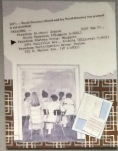
The earliest Alateen registrations were recorded from California and are found in Alateen's first ledger, the "Little Black Book."